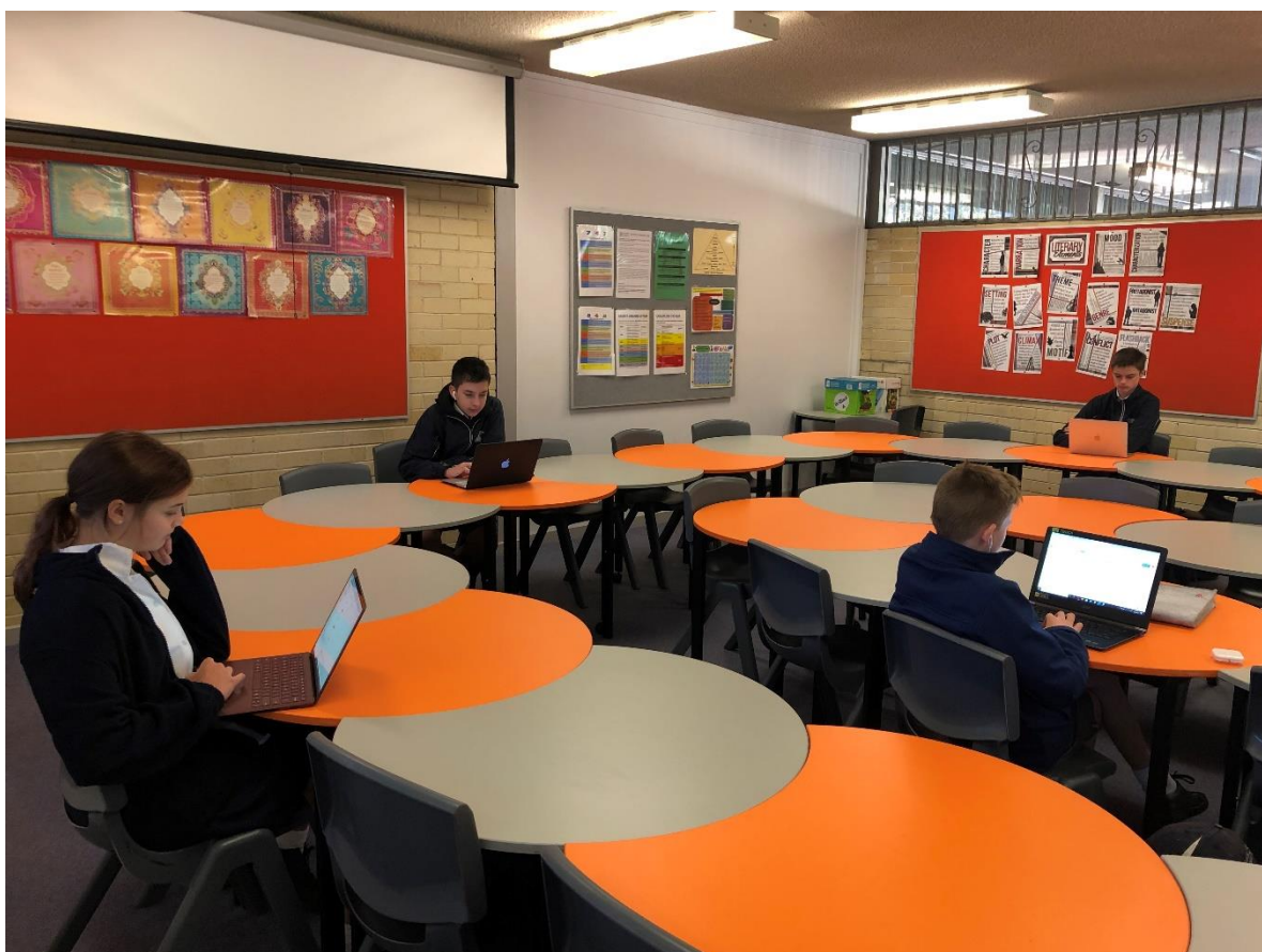
Students observing social distancing while working

We welcome students back to school this week. Students are to wear full winter uniform. As you know every student will be allocated a day to return with an extra day for year 12 on Wednesdays. If you do not wish to send your child on the allocated day, please let the office know. Students will not be disadvantaged by staying home as the online learning will continue.